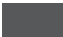
End caps (B)